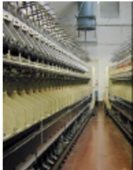
Shop Floor Controls

The low cost provider of internet-based real-time systems has added quality, process and project management services, a natural progression that stems from our expertise in operations research (OR) that we have been applying in our consulting practice over the years. Using proven OR methodologies, Artige's Services Division now offers solutions for workflow, scheduling and queuing dilemmas, improving your bottom line.