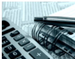
Interfaces to Financial systems

We still offer traditional IT services of system integration and custom application building. Our experience includes system architecture, database design, programming (web or stand-alone applications), and training in IT, quality and manufacturing areas. We can automate your operation, be it cash, work orders or machinery. We excel in interfacing even the most disparate of systems. Consider the Artige Company for your next computing project.